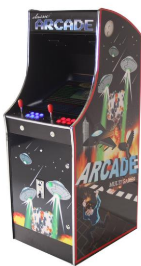
Video Game Publishers: - potential trade buyers.

NES Classic Edition console: 1<sup>st</sup> generation device, revived November 2016. Manufactured by Nintendo<sup>®</sup> - potential trade buyer.